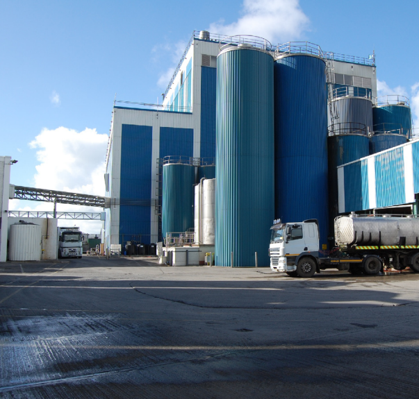
Skim Milk Powder Manufacturing