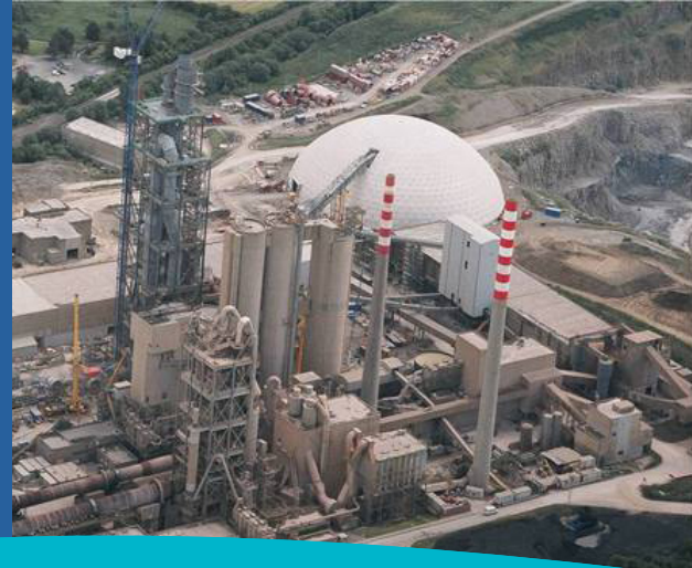
Aerial view - Irish Cement Plant, Platin, County Louth.