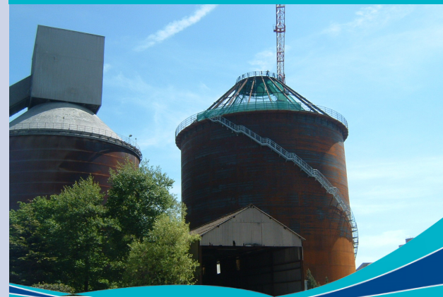
Clinker silo at Irish Cement Plant, County Limerick.