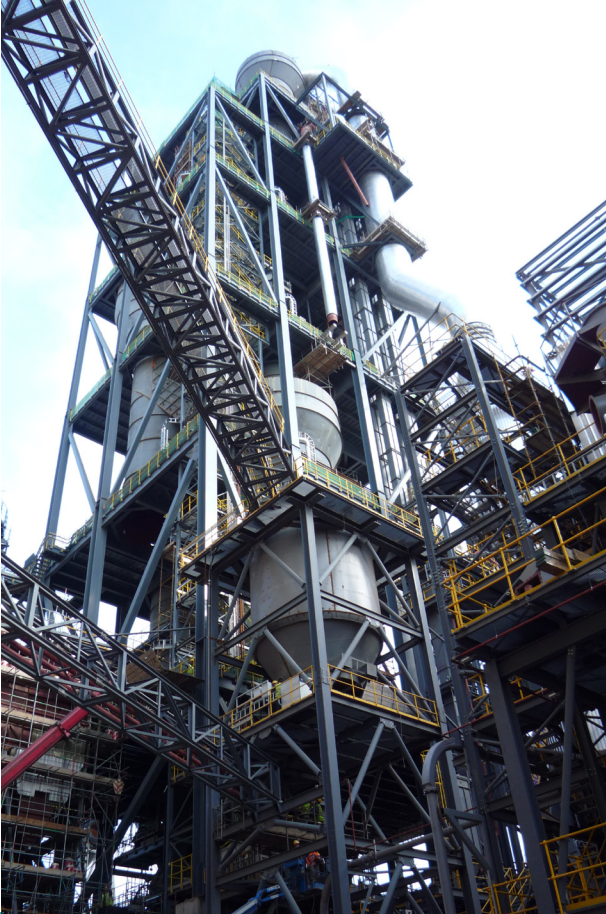
Irish Cement Plant, Platin - Preheater.